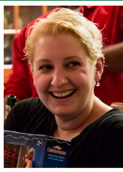
Savanna - April 3